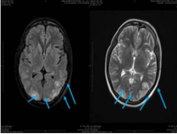
Figure 2: Axial FLAIR and T2 images show near symmetrical hyperintense areas of abnormal signal intensity in bilateral Parieto occipital Region